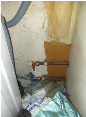
Dead leg in Kitchen