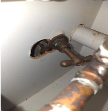
Mains Isolation Valve