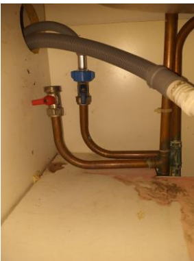
Dead leg in Kitchen